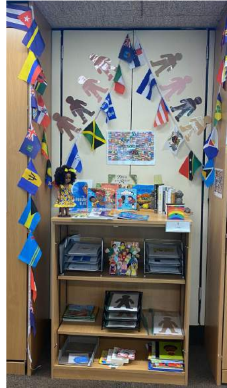
Resource Library in Sutton

Also under development is an information sheet on SCD, which is particularly common in people with an African or Caribbean family background. People with SCD produce unusually shaped red blood cells that can cause problems because they do not live as long as healthy blood cells. This will support practitioners in their work with sufferers, including people with lived experience and the workforce. This will also be shared across the Partnership once complete.